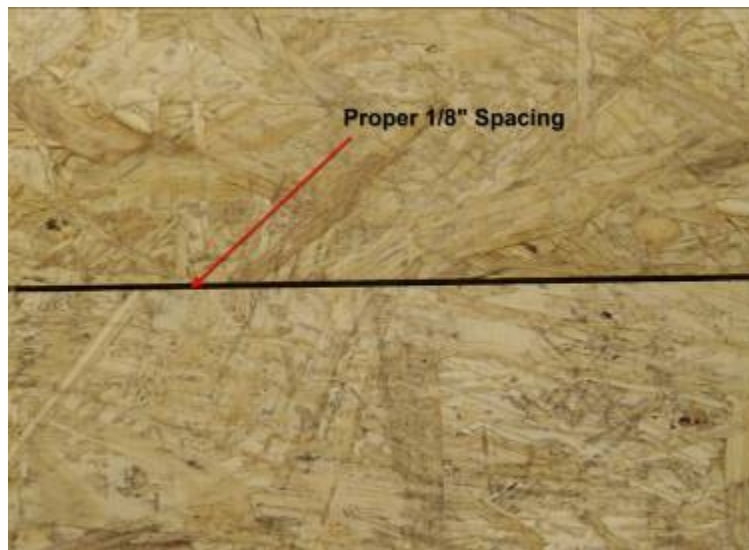
Correct installation of Advantech T&G Edge

FORCING T&G EDGES TO FIT TIGHTLY TOGETHER CAN DAMAGE THE PANELS AND VOID THE WARRANTY. T&G EDGES ARE DESIGNED TO FIT TOGETHER EASILY WHILE PROVIDING THE INDUSTRY STANDARD 1/8" GAP BETWEEN PANELS.